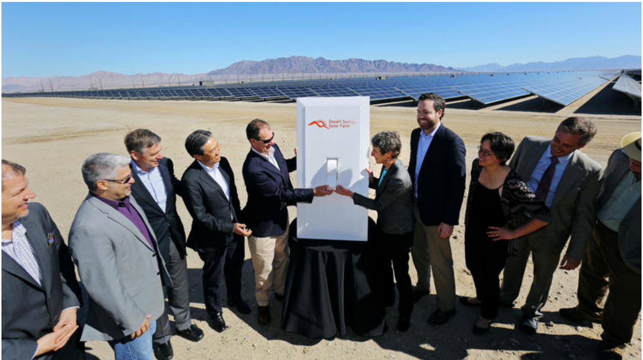
Caption Solar farm